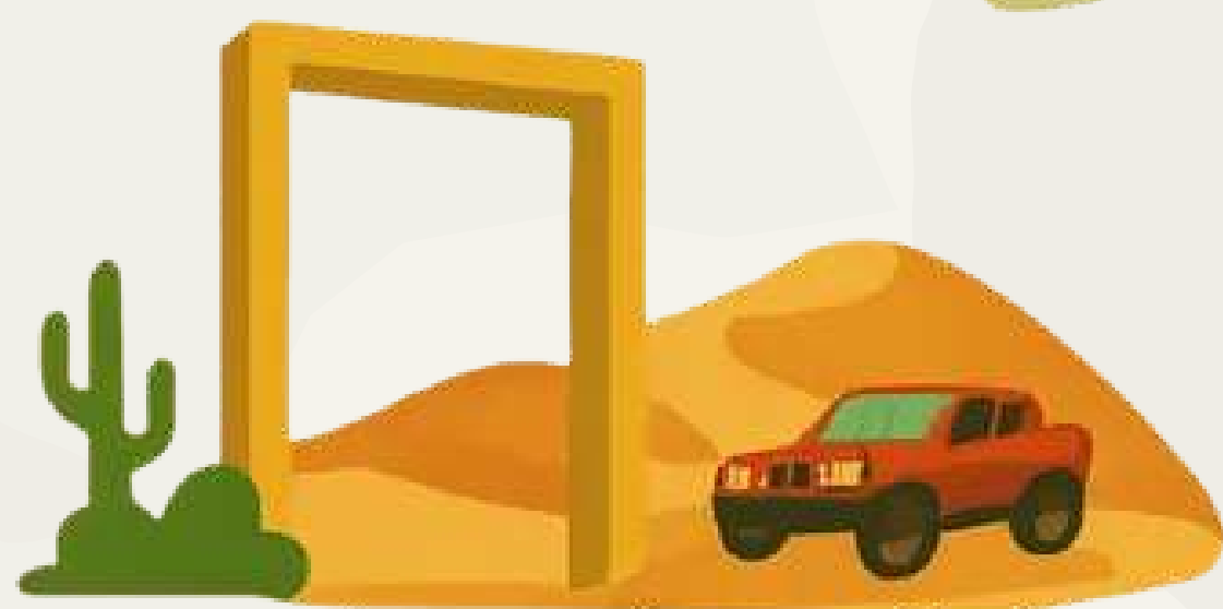
DUBAI FRAME & DESERT SAFARI