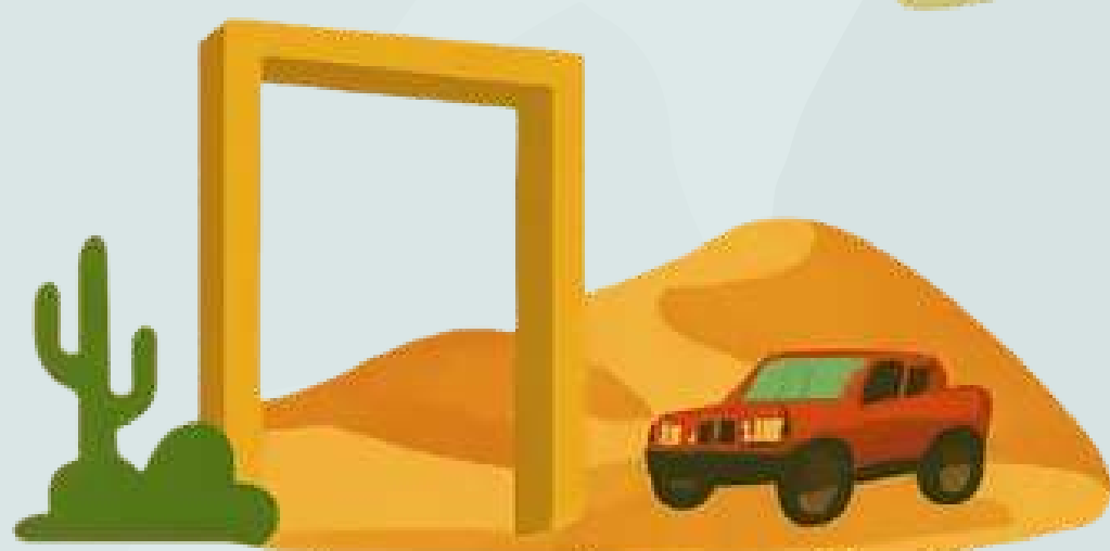
DUBAI FRAME & DESERT SAFARI