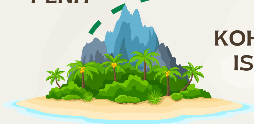
KOH RONG ISLAND