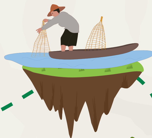
TONLE SAP LAKE