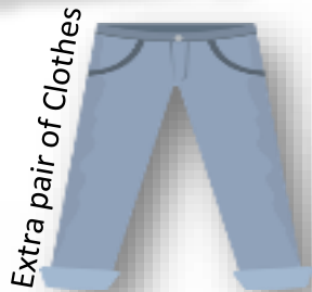
Extra pair of Clothes